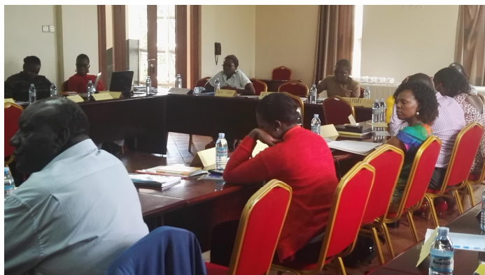
A section of Uganda Human Rights Staff during a Training Session on Elections Monitoring and Observation in Kampala, Uganda

“The training enabled discussion by everyone and good for measuring understanding of the concepts learnt” A participant from the Training