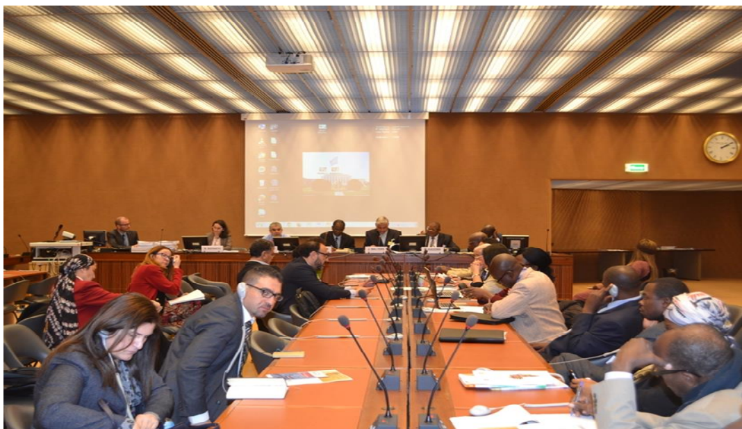
A Side Event Organized by NANHRI and APT to Launch the Book and Film on Lessons and Experiences on Torture Prevention from African NHRIs, 22nd March 2016, Palais des Nations, Geneva

www.apt.ch/en/resources/preventing-torture-in-africa-lessons-and-experiences-from-national-human-rights-institutions/