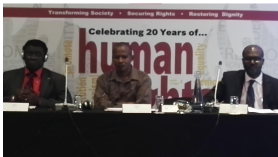
Participants engaging during the African Regional Seminar on SOGIE in Johannesburg, South Africa

The seminar provided an opportunity for participants to reflect on emerging challenges in the continent.