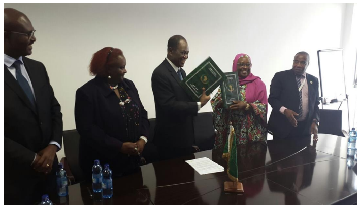
The Signing Ceremony of the Memorandum of Understanding between NANHRI and the Africa Union Commission

NANHRI will leverage on this cooperation in ensuring increased acceleration towards greater integration between the national and regional human rights systems in Africa and consolidating human rights knowledge within the broader purview of democratic governance based on knowledge generated, important experiences and lessons learnt .