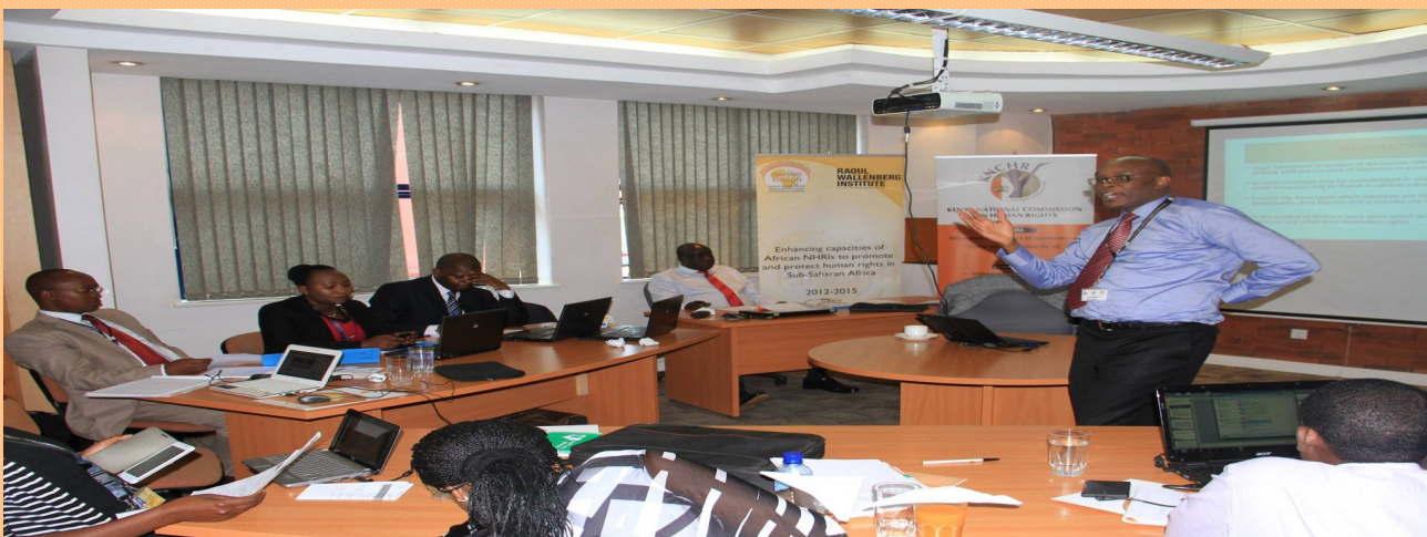
Participants at a capacity building workshop for East African Community NHRIs