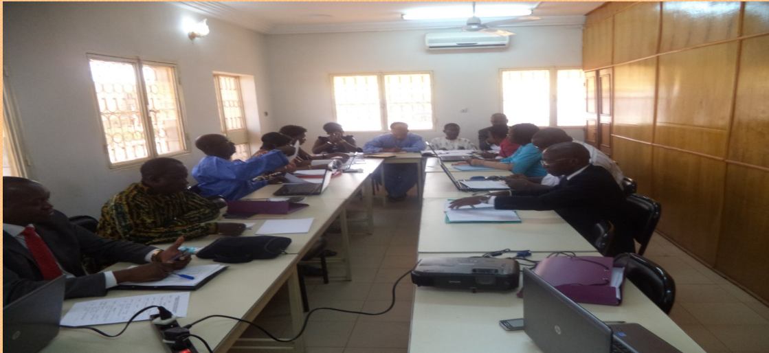
Photo: Members of the governing body meeting

The National Commission on Human Rights of Burkina Faso held its first regular session of 2015 from 18 to 20 February 2015 at its new headquarters. This session of the governing body had the following as the meeting agenda: Review progress reports of projects and financial expenditure, the functioning of the commissions' bodies, review and adopt rules of procedure, review the 2015 prospects